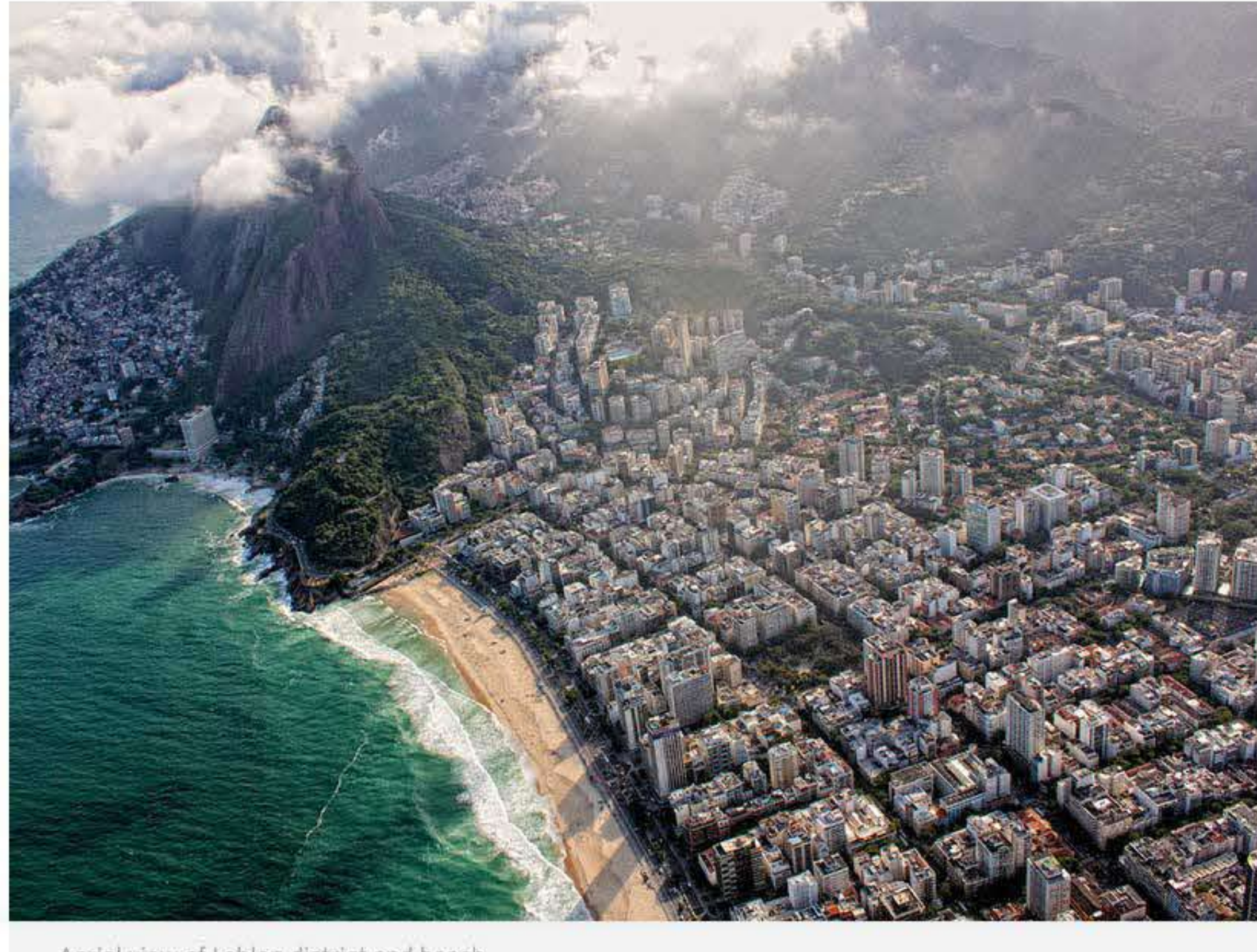
Aerial view of Leblon district and beach.